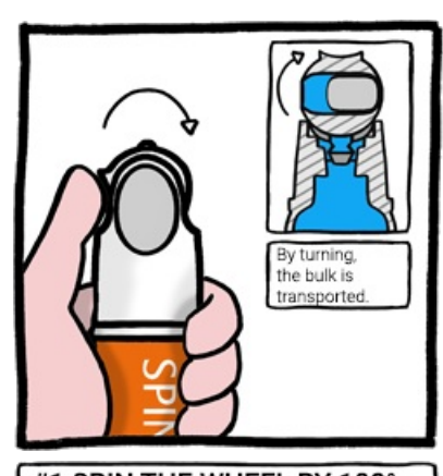
#1 SPIN THE WHEEL BY 180°